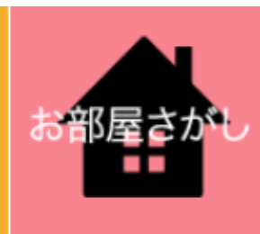
Real Estate Office