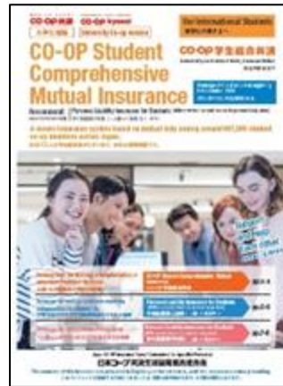
Student Comprehensive Mutual Insurance